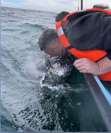
Petting a Grey Whale

https://www.instagram.com/reel/Cam23GNpWTD