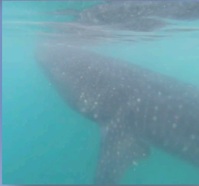
Grey Whale Underwater

https://www.instagram.com/reel/CauuzZpp4le